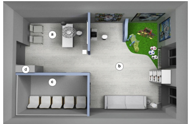
Fig. 1. “Salt Clinic”. 3D design: reception/welcome area (a); waiting room with children's recreation area (b); “Aerosal ® ” halotherapy room (c). ENT Care Unit (d). Cabinet containing the Dry Salt Aerosol Generator – University General Hospital – Bari (Italy).

The room environment is not contaminated with pathogenic microorganisms (as certified by SAS 90 ® measurements). Patients can settle into comfortable chairs inside the room where the dry salt aerosol is blown through a PVC pipe (described below). A centrifugal extractor fan (air flow rate 90 m 3 /h), placed on the side opposite to the PVC pipe ensures a number of complete changes of air in full compliance with requirements in terms of CO 2 ppm values, i.e. <750 ppm. Also temperature and humidity are kept at constant values ranging between 20 °C and 24 °C and 44% and 60%, respectively (TESTO 435-4 ® Digital Multimeter measurements).