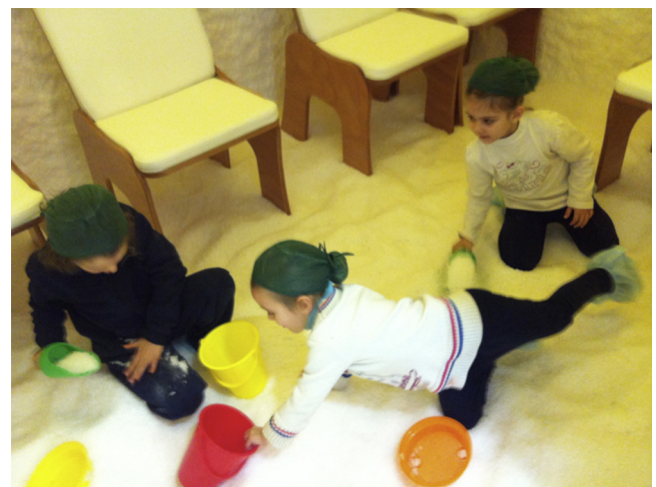
Fig. 2. “Aerosal ® ” Halotherapy Salt Room where children are always highly compliant as they consider treatment sessions as opportunities for play and recreation. ENT Care Unit–University General Hospital – Bari (Italy).

After collection of medical history, all the patients underwent clinical and instrumental exams as follows: ENT visit with inspection of the oropharyngeal tract and tonsillar hypertrophy staging (0°–4°) [27], flexible fibroscope nasal endoscopy (ENT 2000